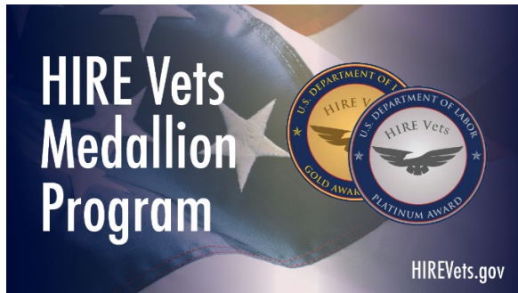
Twitter Graphics (1200 x 675 pixels)