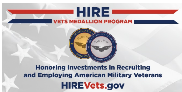
High Resolution (4267 x 2133) .jpg