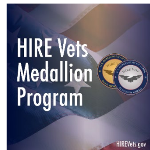
Instagram Graphic (1080 x 1080 pixels)